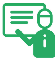
Startups / VC seminars