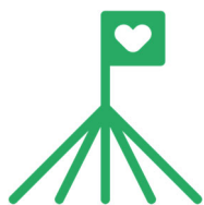
Care technology summits