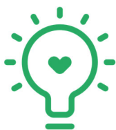
Caretech startup awards