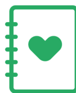
Startup support guidebooks