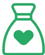
Intellectual property and exit strategy formulation support