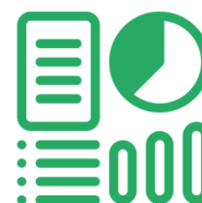
Surveys and summary

Care Innovation Startup Support Program powered by CARISO Secretariat Inside the Medicine and Health Ecosystem Division of the Mitsubishi Research Institute, Inc. TEL: 03-6858-3289 E-mail: cariso-su@ml.mri.co.jp